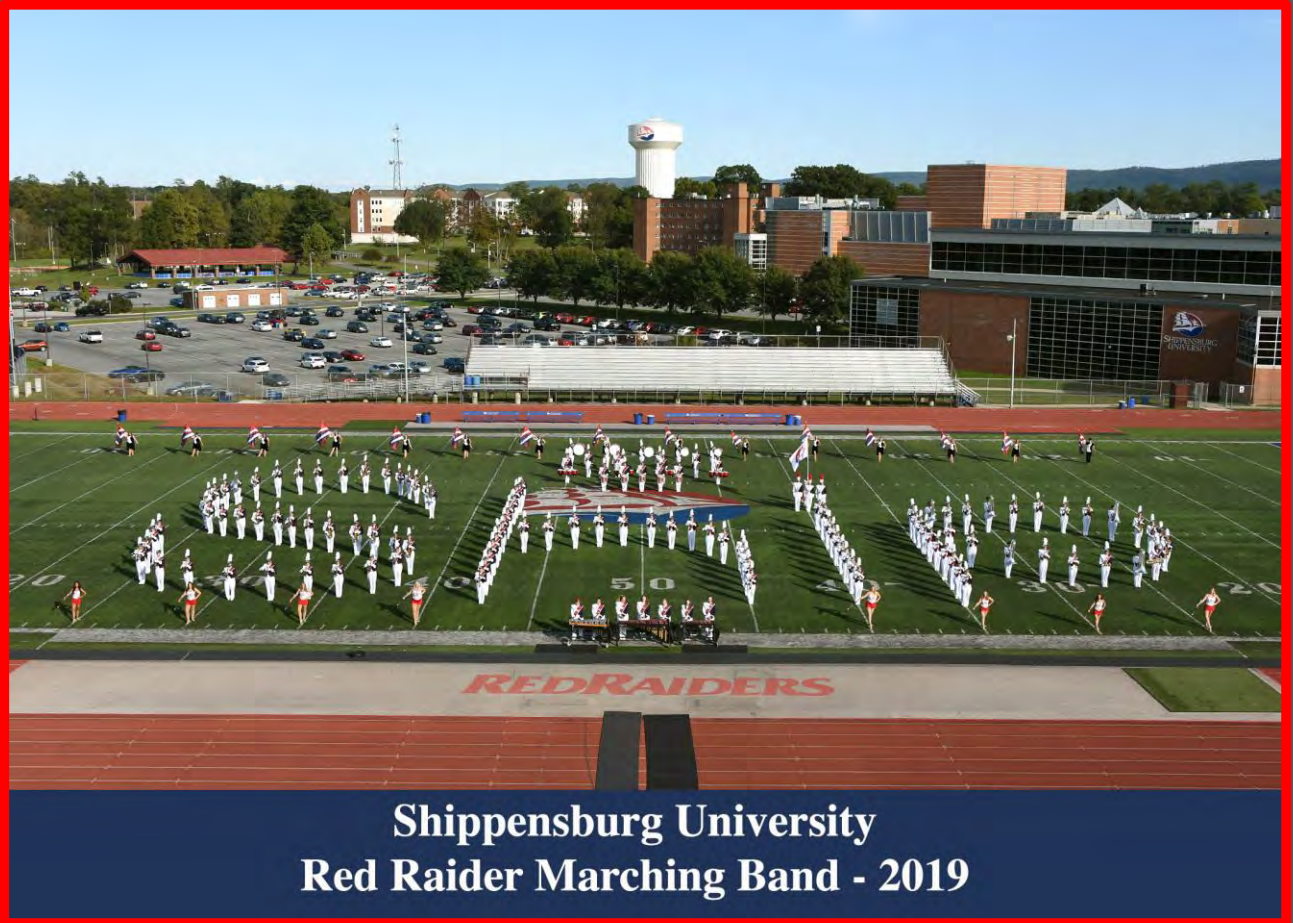
Shippensburg University Red Raider Marching Band - 2019